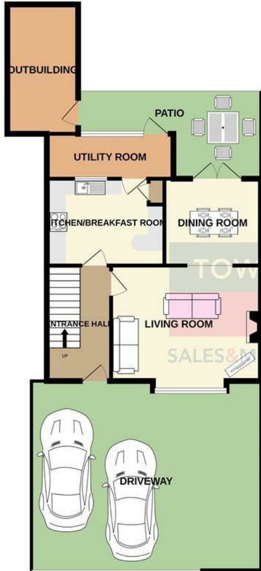
GROUND FLOOR 609 sq.ft. (56.6 sq.m.) approx.